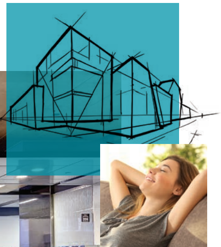
Project – James Michael Flaherty Building in Ottawa, Ontario LEED Gold Certification